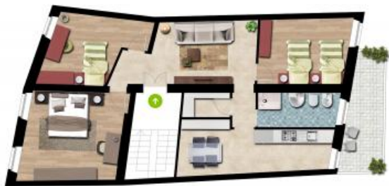
VIA LANZEROTTO MALDCELLO, PIANO TERZO